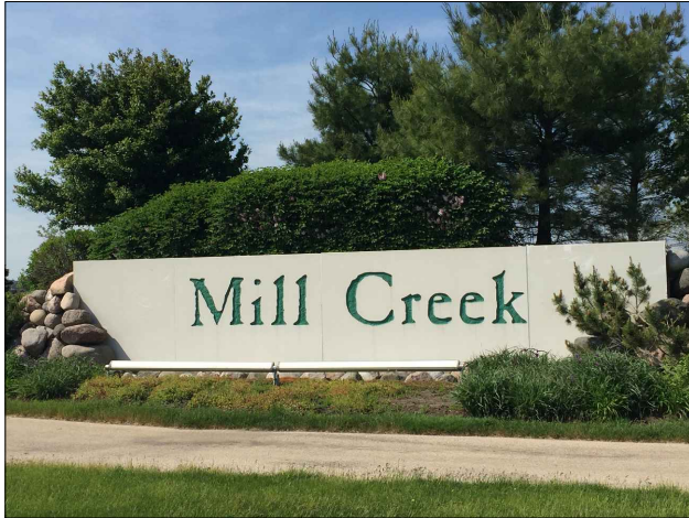
MILL CREEK SIGN (1 OF 2 SIGNS) 6'-5" TALL, 40' LONG 264 SFT APPROX.