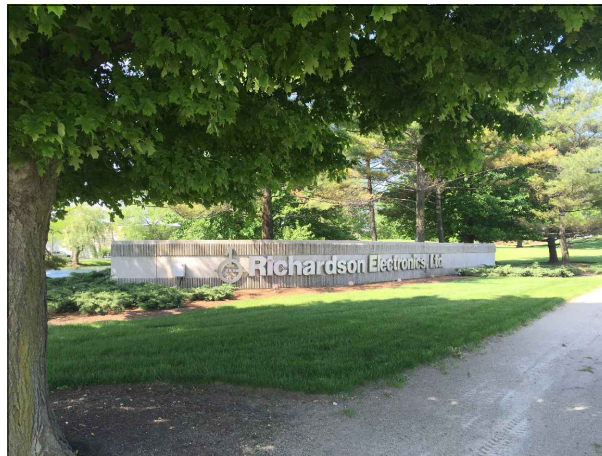
RICHARDSON ELECTRONICS SIGN (1 OF 2 SIMILAR SIGNS) 5' TALL, 70' LONG 350 SFT APPROX.