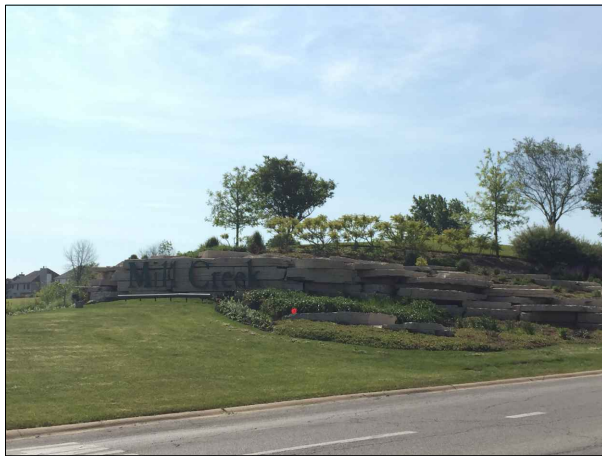
MILL CREEK (2 OF 2 SIGNS) 4' TALL, 70' LONG 300' SFT APPROX.