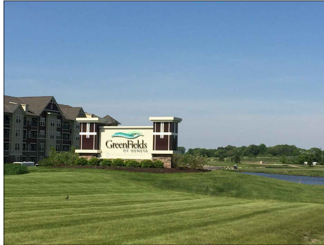
GREEN FIELDS SIGN 10'-9" TALL, 23' LONG 247 SFT APPROX.